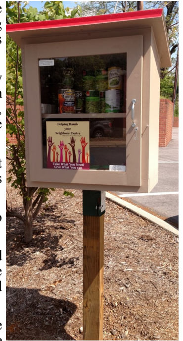
This pantry is located at the Elkin City Hall/Police Department in the median between the parking lots.